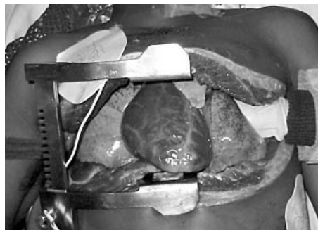
Figure 3 Open chest. Rib spreaders in situ. Central heart. In this picture the pericardium has been displaced by internal cardiac massage and lies behind the heart. Gloved hand compressing the aorta.

The procedure and equipment used to perform a thoracotomy in a cardiothoracic operating theatre is highly specialised. To